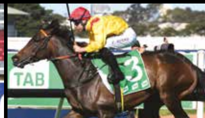
Mizzy – Dual Gr.2 winner