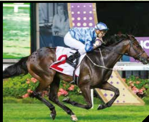
Top Knight – Gr.1 Singapore Guineas winner