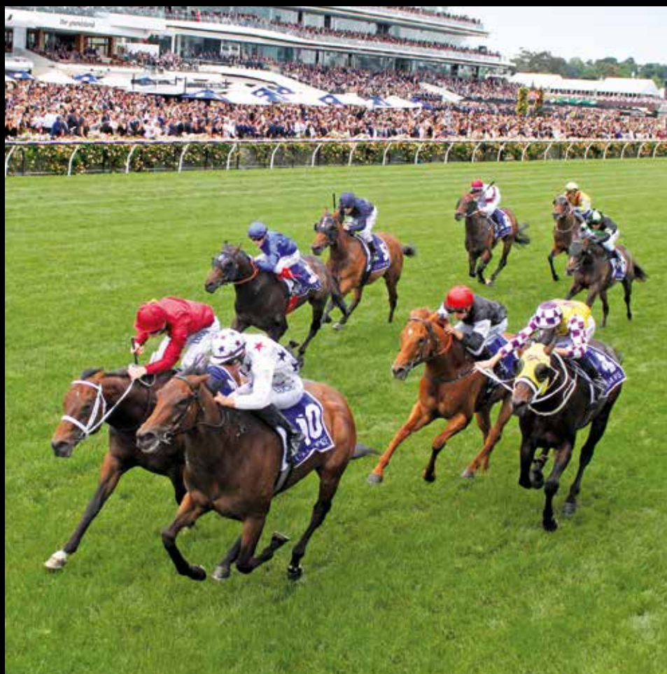
Sunlight wins the Coolmore Stud Stakes Gr.1 in a magnificent 1-2-3 for Zoustar