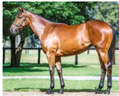
Filly ex Bryony AUS $280,000 Ciaran Maher Bloodstock

His yearlings continue to impress at the sales in 2019, realising $280,000, $250,000, $180,000, €130,000, €90,000, etc.