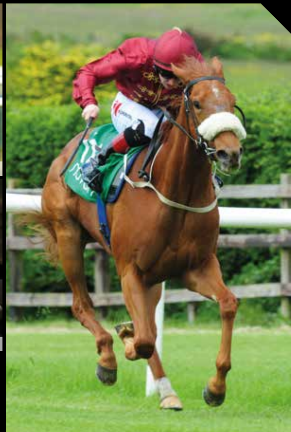
Treasuring – Dual Gr.3 winner