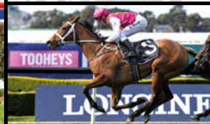
Haut Brion Her – Gr.2 winner