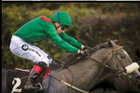
Zunoon – 2nd in Gr.3 Desmond Stakes, behind Madhmoon