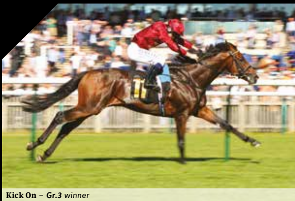
Kick On – Gr.3 winner