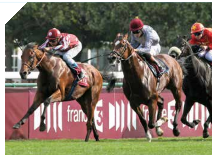
Charm Spirit beats Gr.1 winners Toronado and Night Of Thunder to win the Prix du Moulin de Longchamp Gr.1

RANSOM O'WAR (USA), Top rated 3yr old in Germany in 2003 (9.5-10.5f), 3 races at 2 and 3 years at home and in Germany including G.Dallmayr-Preis Bayerisches Zuchtrennen, Munich, Gr.1, second in BMW Deutsches Derby, Hamburg, Gr.1; sire.