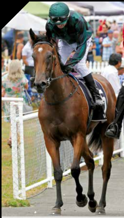
Aretha – Gr.2 winner and Gr.1 placed