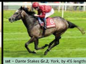
1st – Dante Stakes Gr.2, York, by 4½ lengths