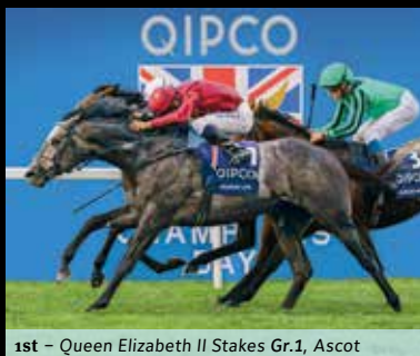
1st – Queen Elizabeth II Stakes Gr.1, Ascot