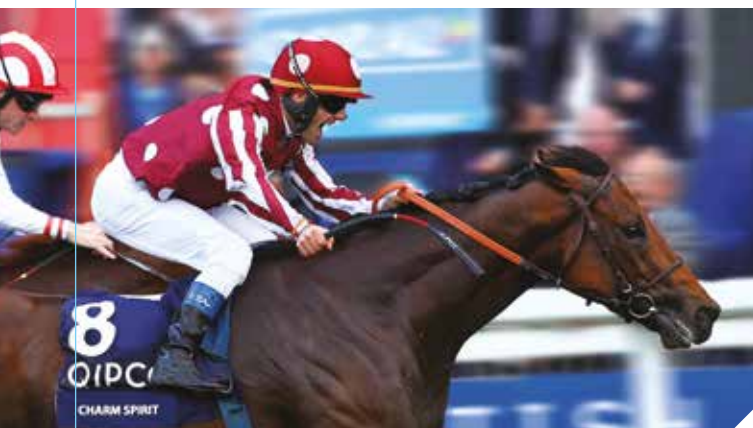
Charm Spirit lands the Queen Elizabeth II Stakes, Gr.1 defeating Gr.1 winners Night of Thunder, Integral, Toormore and Kingsbarns