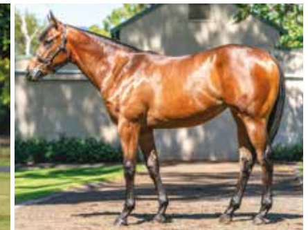
Filly ex Chanel Number Five AUS $180,000 CB Bloodstock / Phillip Stokes Racing