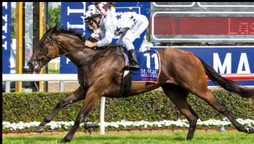
Sunlight – Triple Gr.1 winner and Champion 3yo filly