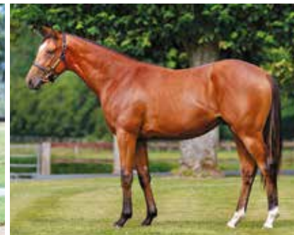
Colt ex Militante €130,000 The Hong Kong Jockey Club