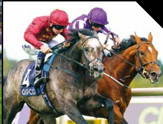
1st – QIPCO Irish Champion Stakes Gr.1, Leopardstown