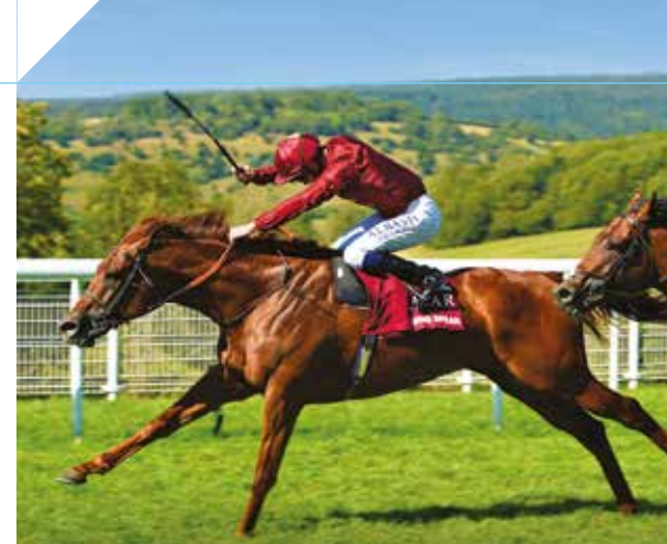
Lightning Spear – Sussex Stakes Gr.1 winner

Handicap, Santa Anita, Gr.1, third in Ramona Handicap, Del Mar, Gr.1.