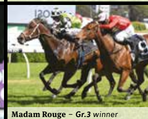
Madam Rouge – Gr.3 winner

Sire of 13 Stakes winners to date including Gr.1 winners Sunlight and Top Knight