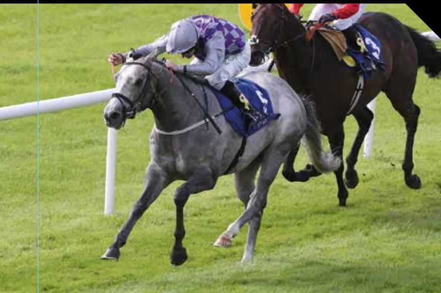
Havana Grey – Winner of five Stakes races, including Gr.1 Flying Five Stakes

“Havana Grey is one of the fastest I have trained, if not the fastest. Apart from his obvious speed he has a great constitution, great attitude to work, and has been a very sound horse.”