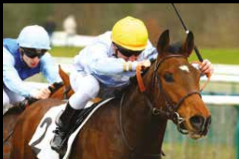
Barade – Listed winner

Proven Gr.1 producing sire with 6 Stakes winners from his first crop