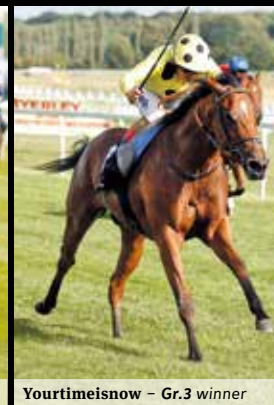
Yourtimeisnow – Gr.3 winner

“She’s a tough filly, she had to work when the other filly came back at her, but she was in for the fight. She’s a real racehorse.”