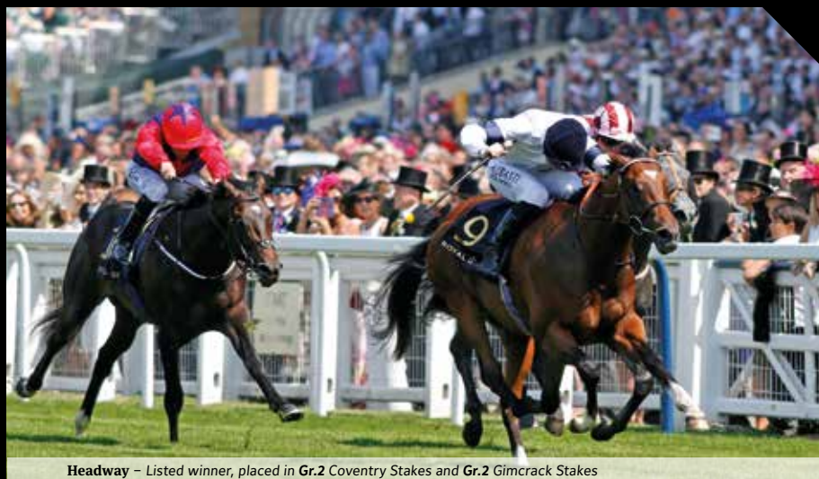
Headway – Listed winner, placed in Gr.2 Coventry Stakes and Gr.2 Gimcrack Stakes