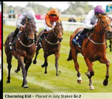
Charming Kid – Placed in July Stakes Gr.2