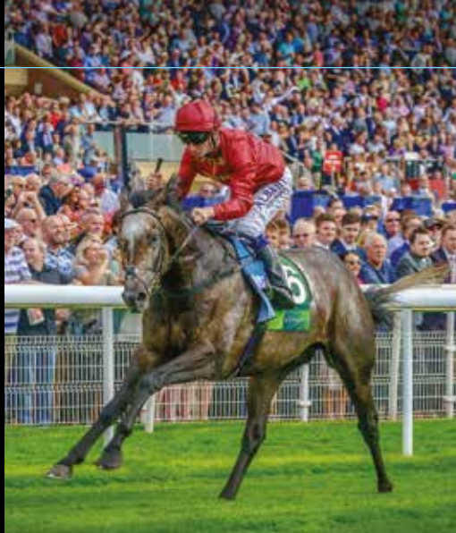
1st – Juddmonte International Stakes Gr.1, York