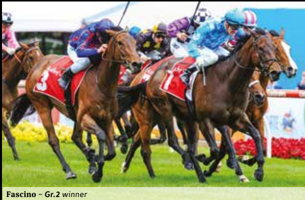
Fascino – Gr.2 winner