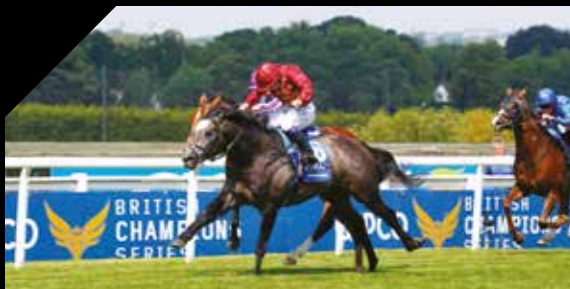
1st – Coral-Eclipse Gr.1, Sandown