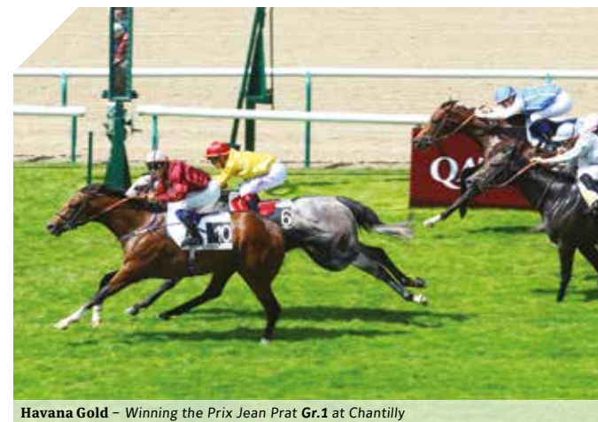
Havana Gold – Winning the Prix Jean Prat Gr.1 at Chantilly