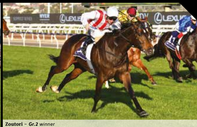
Zoutori – Gr.2 winner

A leading sire of Group winners in Australia in 2019