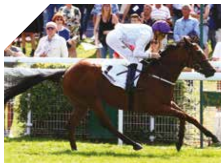
Flaming Princess – Stakes winner and Gr.3 placed 2yo

TAKREES (USA) , 3 races at 3 and 4 years, 2017 in U.S.A. including Interborough Stakes, Aqueduct, L., third in Prioress Stakes, Saratoga, Gr.2.