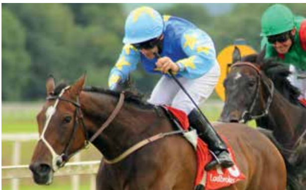
THERMOPYLAE – dam of Gr.3 winner and Gr.1 St Leger performer UNSUNG HEROINE, and Stakes performer GHOSTMILK. An own/half-sister to CARRY THE FLAG and POSIDONAS.