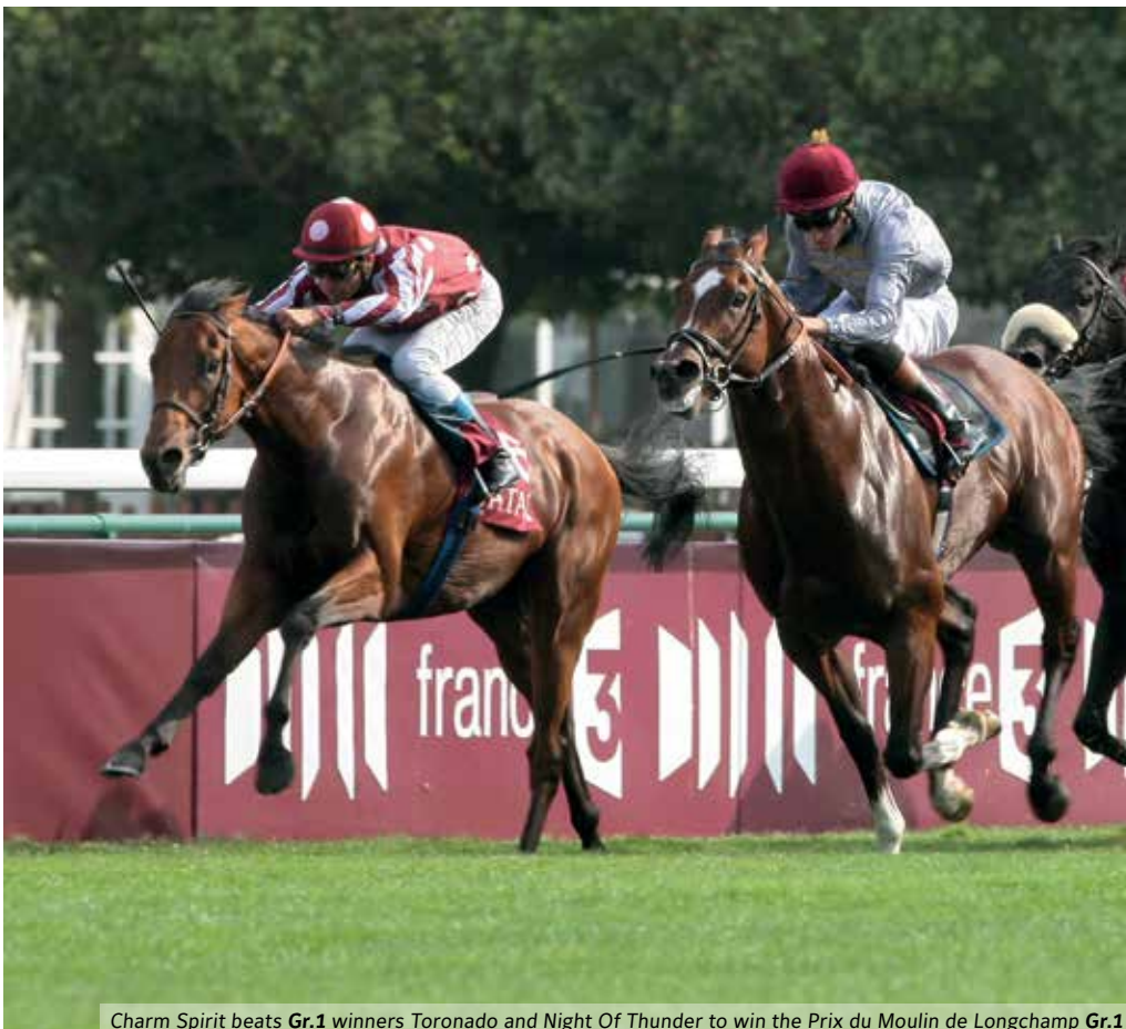
Charm Spirit beats Gr.1 winners Toronado and Night Of Thunder to win the Prix du Moulin de Longchamp Gr.1