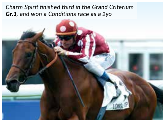
Charm Spirit finished third in the Grand Criterium Gr.1, and won a Conditions race as a 2yo