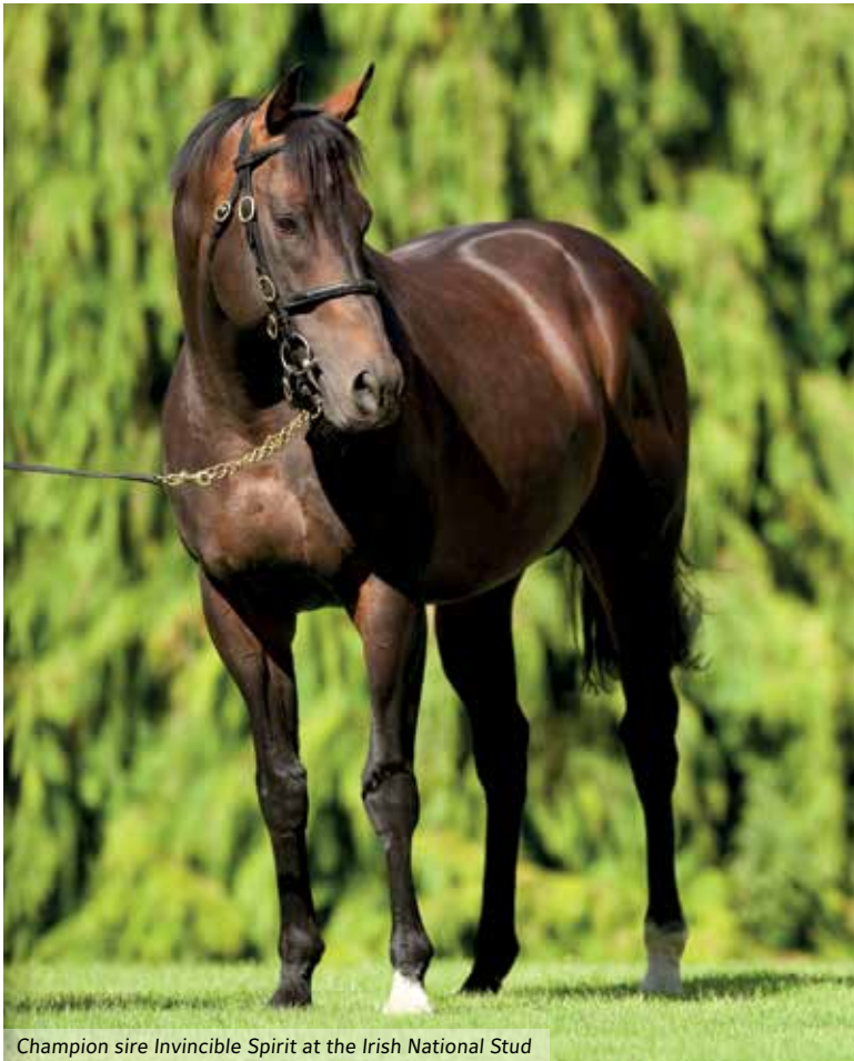
Champion sire Invincible Spirit at the Irish National Stud