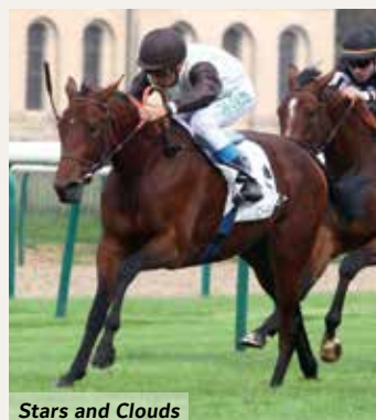
Stars and Clouds