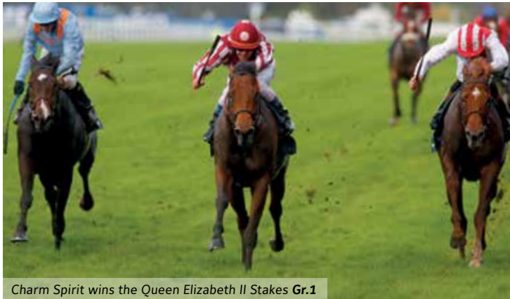
Charm Spirit wins the Queen Elizabeth II Stakes Gr.1