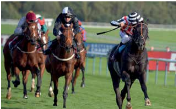
TRICK OR TREAT – won Wilmott Dixon Stakes Gr.3, Pinnacle Stakes L, 3rd Yorkshire Oaks Gr.1. Dam of 4 winners from 4 runners including 2yo 2014 Stakes performer MEDRANO.

“Havana Gold appealed to me as he was sound and consistent at the top level. He’s a very good looking, well balanced horse, from a top sire line out of a mare who was a tough and classy sprinter by a proven broodmare sire. I look forward to seeing his foals.”