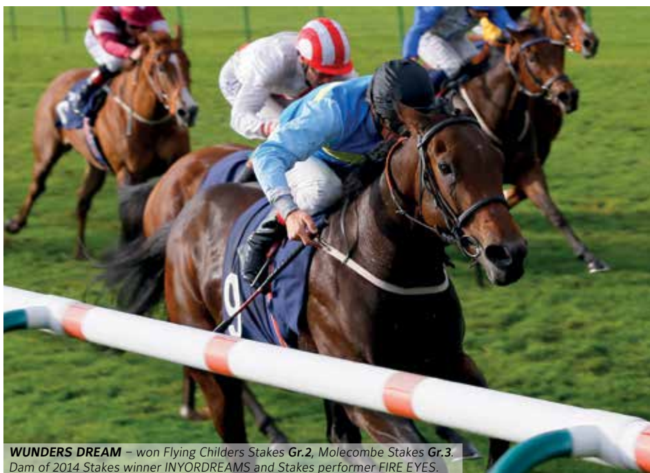
WUNDERS DREAM – won Flying Childers Stakes Gr.2, Molecombe Stakes Gr.3. Dam of 2014 Stakes winner INYORDREAMS and Stakes performer FIRE EYES.