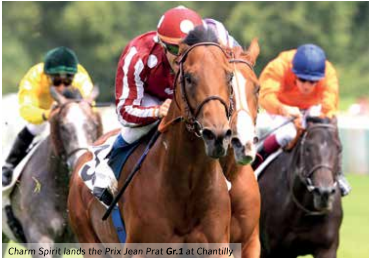
Charm Spirit lands the Prix Jean Prat Gr.1 at Chantilly