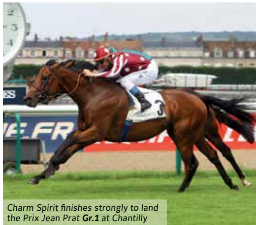
Charm Spirit finishes strongly to land the Prix Jean Prat Gr.1 at Chantilly