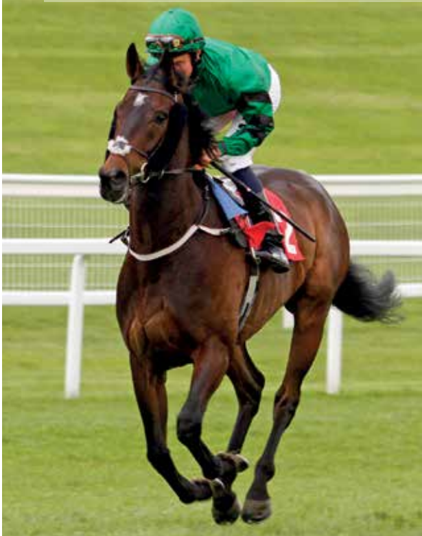
DUMNONI – multiple Stakes performer, and dam of CAMBORNE, winner of Dubai Duty Free Legacy Cup Arc Trial Gr.3 and 2nd Cumberland Lodge Stakes Gr.3.