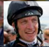
Richard Hughes Champion Jockey

“Harbour Watch is probably the best moving horse I have ever ridden with a beautiful, almost unique way of galloping. He had an abundance of speed and ability but what I really loved about him was the way he stuck his neck out and really tried. He really, really wanted to win.”