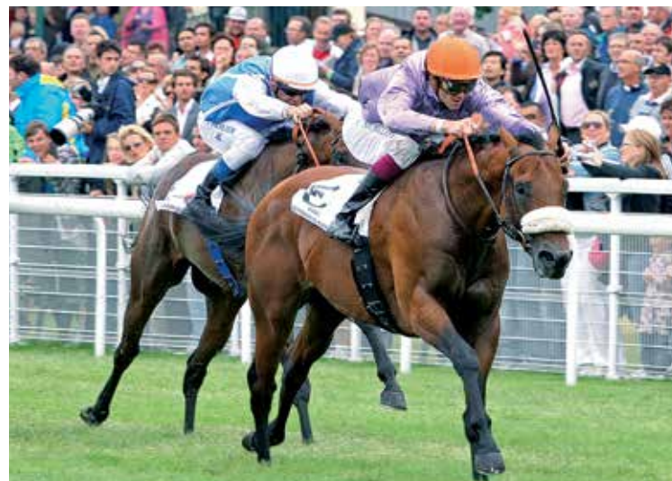
Makfi destroys the classy opposition to win the Prix Jacques le Marois Gr.1