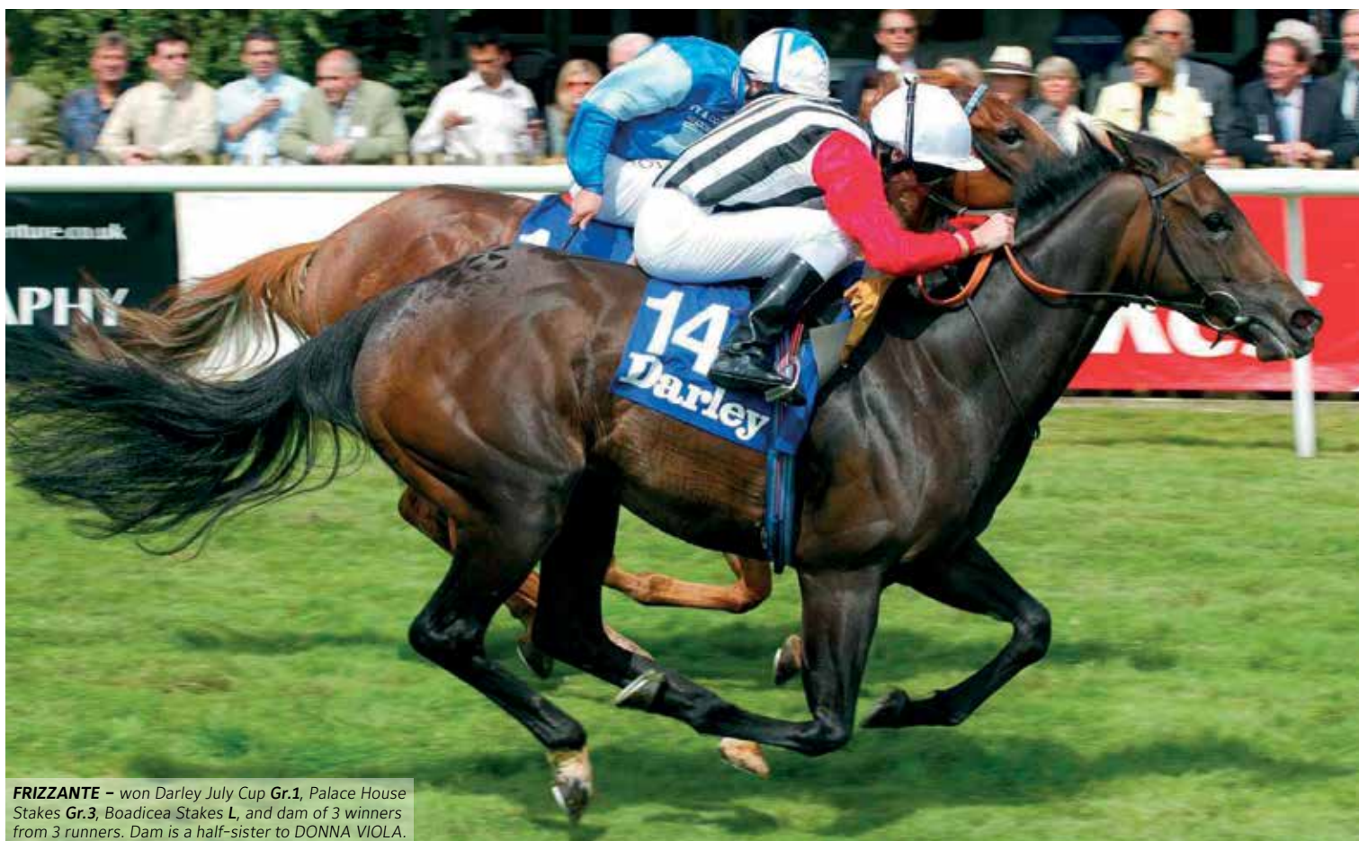
FRIZZANTE – won Darley July Cup Gr.1, Palace House Stakes Gr.3, Boadicea Stakes L, and dam of 3 winners from 3 runners. Dam is a half-sister to DONNA VIOLA.