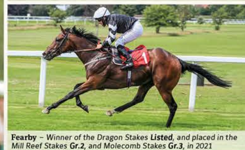
Fearby – Winner of the Dragon Stakes Listed, and placed in the Mill Reef Stakes Gr.2, and Molecomb Stakes Gr.3, in 2021