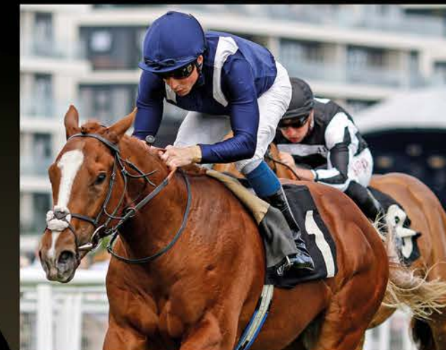
Chateau (Havana Gold) winner of the Rose Bowl Stakes Listed, in 2022.