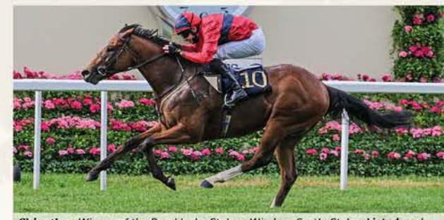
Chipotle – Winner of the Brocklesby Stakes, Windsor Castle Stakes Listed, and Redcar 2YO Trophy Listed