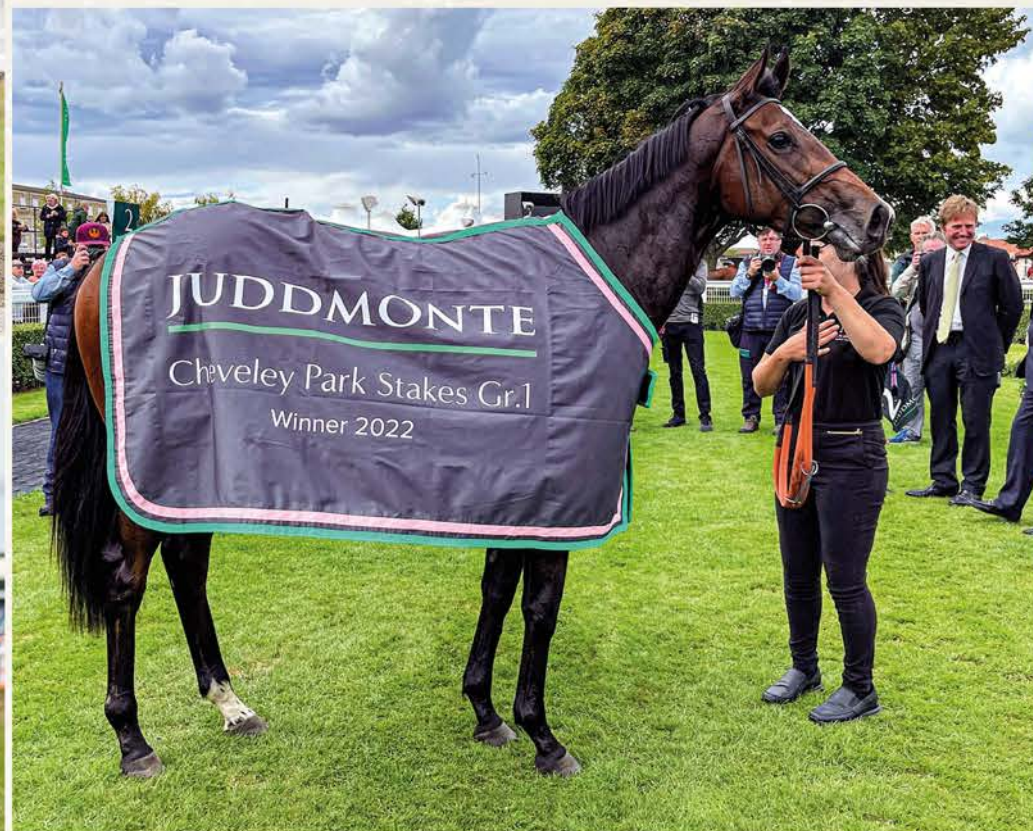
Lezoo (RPR 112) Winner of 3 Stakes races including the Cheveley Park Stakes Gr.1