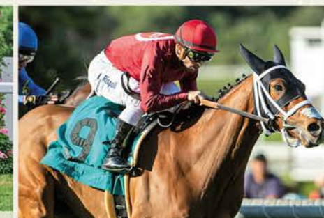
Hariboux – Dual Stakes winner in the US