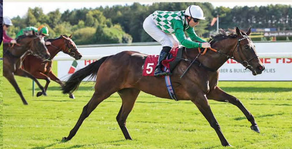
Couplet (RPR 85) Winner on debut by 2¼ lengths