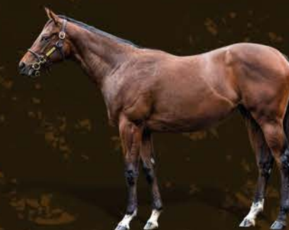
Filly ex Dice Game Sold for 325,000gns to Karl and Kelly Burke

31 yearlings now sold for over 100,000gns including: