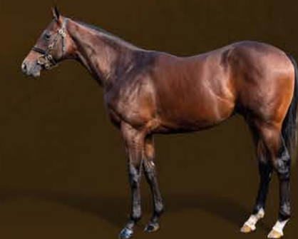
Colt ex Talampaya Sold for 200,000gns to Blandford Bloodstock having been bought for 95,000gns as a foal