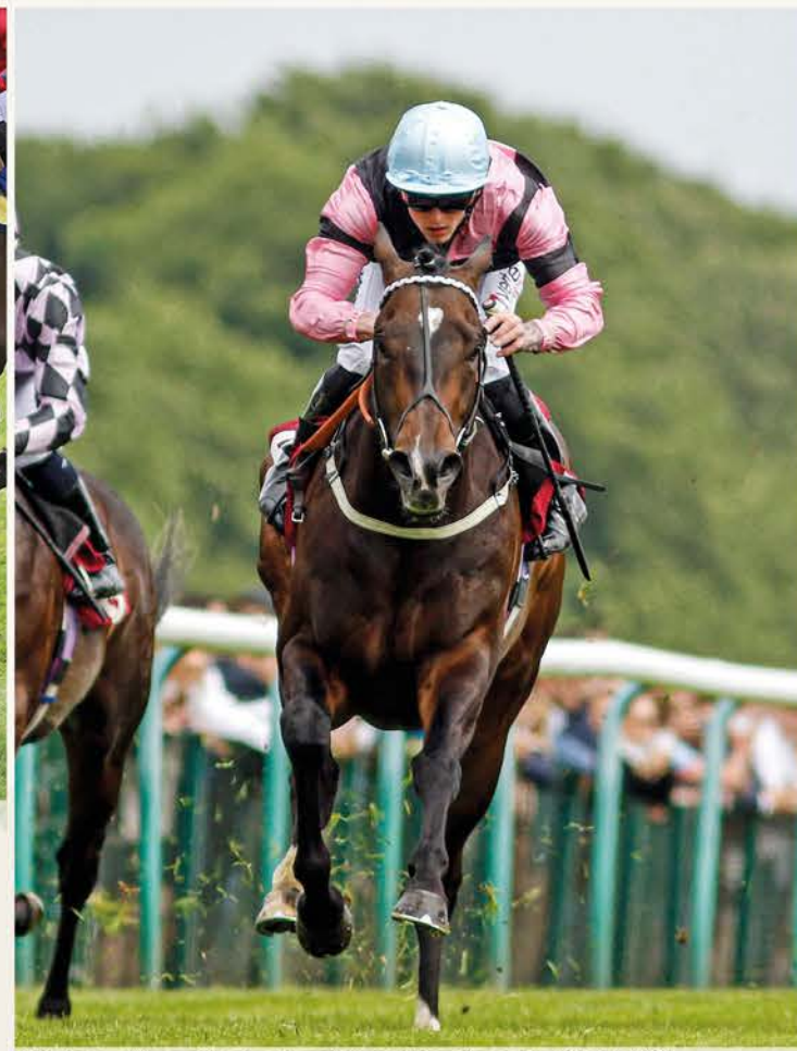
El Caballo – Winner of the Sandy Lane Stakes Gr.2, and Spring Cup Listed, in 2022