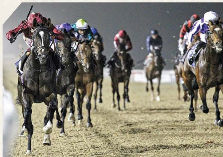
Kameko – Winner of the Vertem Futurity Stakes, Gr.1 defeating dual Gr.1 winners Mogul and Kinross