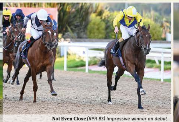
Not Even Close (RPR 83) Impressive winner on debut