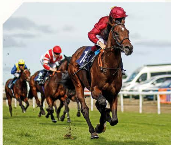
Zooology (RPR 92) Winner on debut by 4 lengths