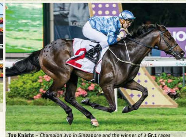
Top Knight – Champion 3yo in Singapore and the winner of 3 Gr.1 races