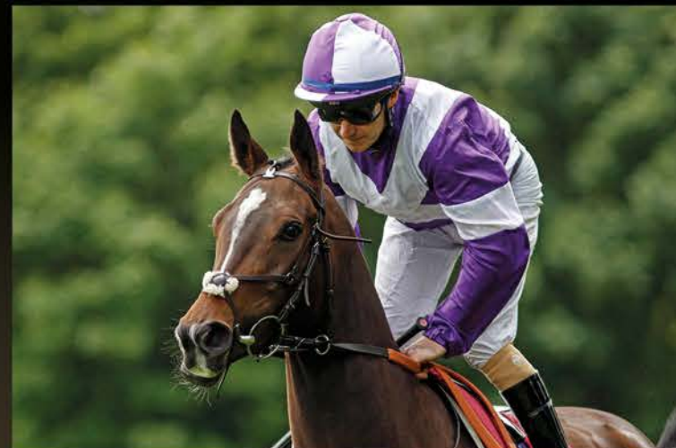
Tippy Toes (Havana Gold) winner of the Chelmer Stakes Listed, in 2022.