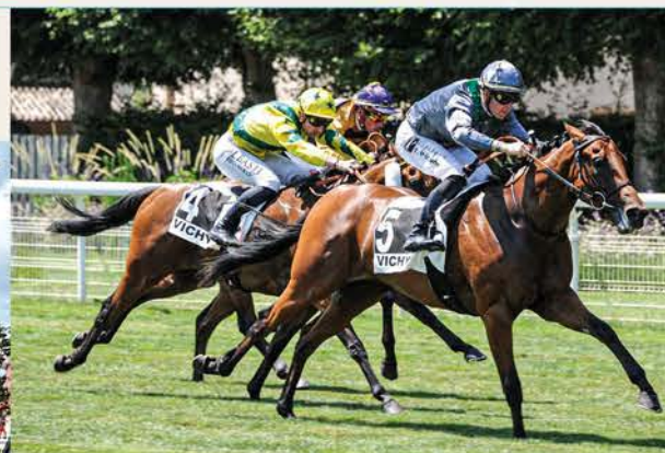
Zudu Spirit (RPR 97) Winner of 3 races at 2 in France