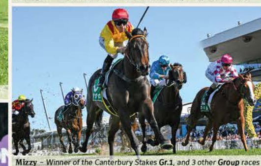
Mizzy – Winner of the Canterbury Stakes Gr.1, and 3 other Group races