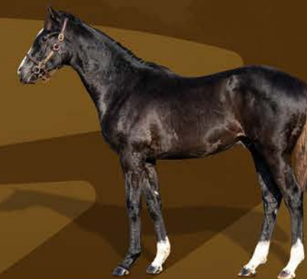
Colt out of Golden Spell

Aga Khan Studs Ballylinch Stud Bearstone Stud Chasemore Farm Coolmore Ecurie Des Monceaux Juddmonte Meon Valley Stud Mickley Stud New England Stud Newsells Park Stud Plantation Stud Watership Down Stud Whitsbury Manor Stud