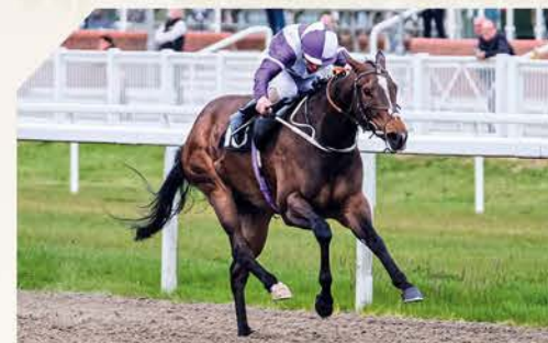
Tippy Toes – Winner of the Chelmer Fillies' Stakes Listed, in 2022