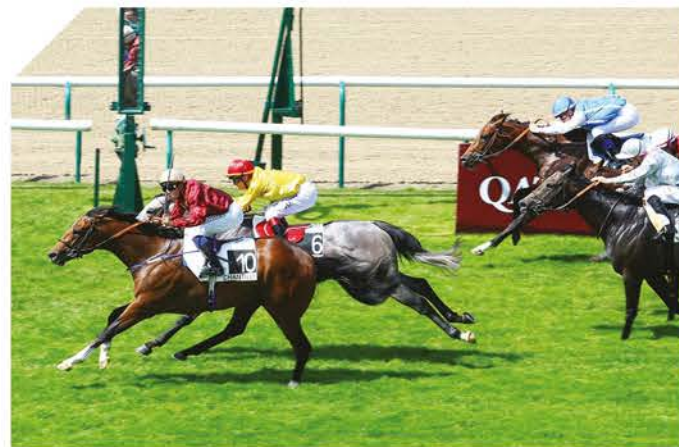
Havana Gold – Winning the Prix Jean Prat Gr.1 at Chantilly

MAJORS CAST (IRE) (c. by Victory Note (USA)), won 6 races at home and in U.A.E. from 3 to 5 years and £312,826 including Betfred Million Spring Trophy Stakes, Haydock Park, L., placed second in Juddmonte Lockinge Stakes, Newbury, Gr.1 , Totesport Celebration Mile, Goodwood, Gr.2 , Hungerford Stakes, Newbury, Gr.3 , third in Prix du Moulin, Longchamp, Gr.1 , Lennox Stakes, Goodwood, Gr.2 .