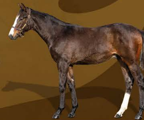
Colt out of Bella Nouf