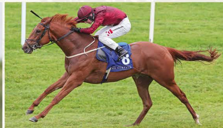
Treasuring – Dual Gr.3 winner including in the US