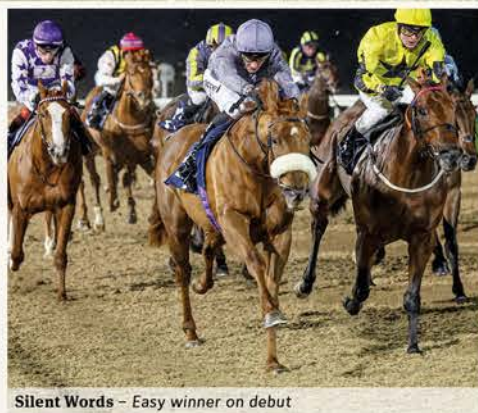
Silent Words – Easy winner on debut