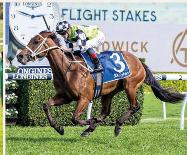
Zougotchka – Winner of the Flight Stakes Gr.1, and 2 Gr.2 races in 2022