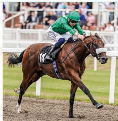
Zu Run (RPR 90) Broke his maiden by 2½ lengths

“Lezoo would be the best two-year-old filly that I’ve ever had - we’ve had nothing as good as this at this stage.”