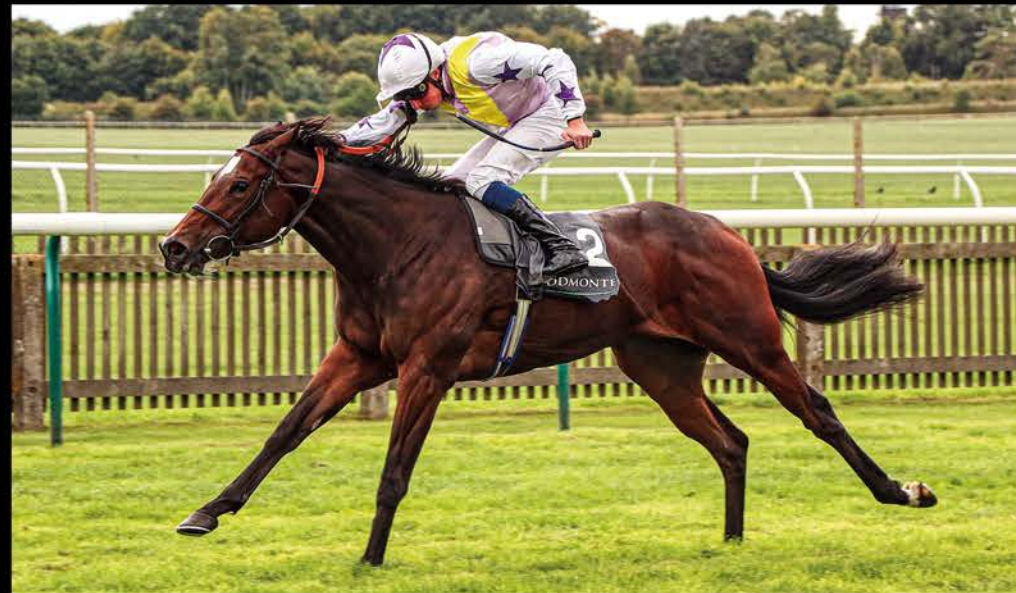
Lezoo (Zoustar) winner of the Cheveley Park Stakes Gr.1, Princess Margaret Stakes Gr.3, and Empress Stakes Listed, in 2022.

For full terms and conditions please visit tweenhills.com