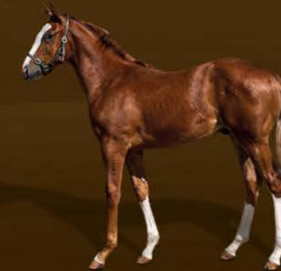
Colt out of Ship Of Dreams