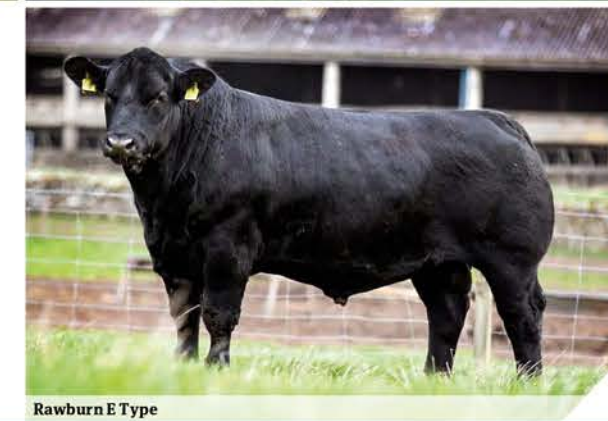
Rawburn E Type

In addition to the purchase of one of the top Aberdeen Angus bulls Rawburn E Type, 2022 saw the Tweenhills Angus compete on the County Show circuit. Tweenhills Red Phoenix, shown by Farm Manager Werner Aucamp were the winners of classes at the Royal Three Counties Show and were also placed at the Aberdeen Angus Cattle Society National Summer Show at the Royal Norfolk Show.