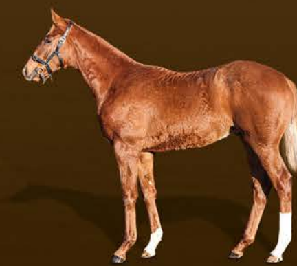
Colt out of Miss Sugars

“When you consider the facile 2yo Gr.1 victory and his record-breaking Guineas, he’s a no brainer for our shortlists.”