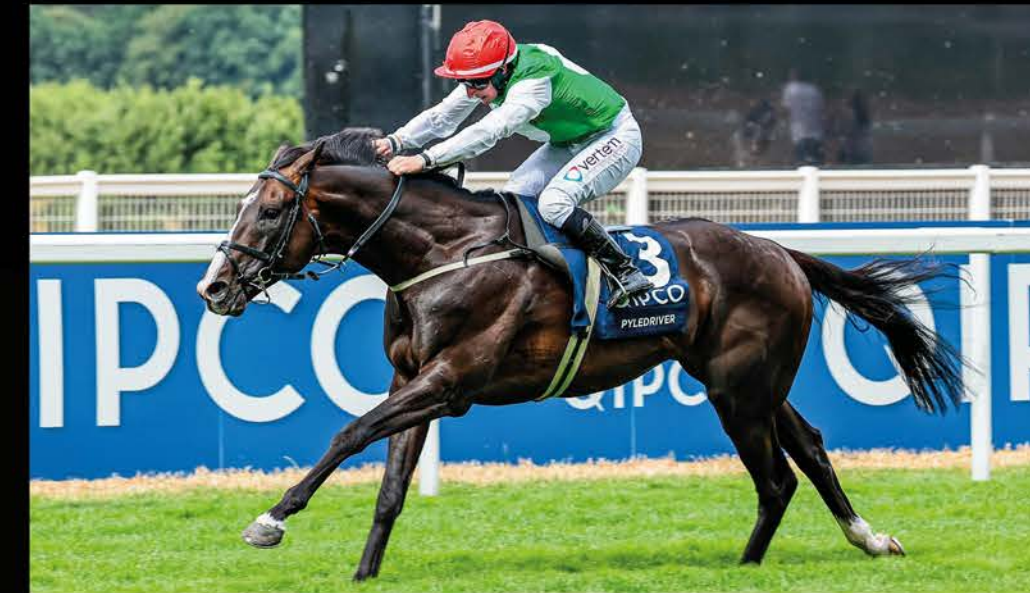
Pyledriver (Harbour Watch) winner of the King George VI and Queen Elizabeth QIPCO Stakes Gr.1, in 2022.