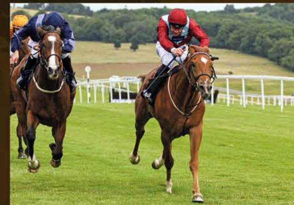
Greased Lightning – Winner on debut