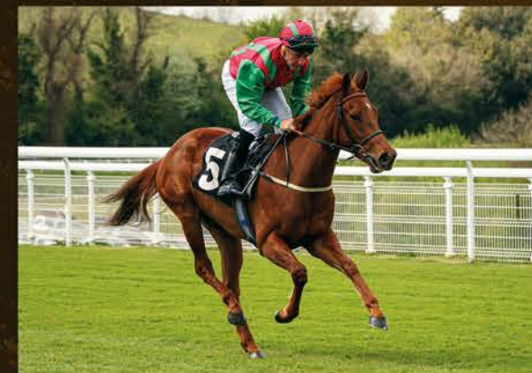
Destiny's Spirit – Winner of 3 races