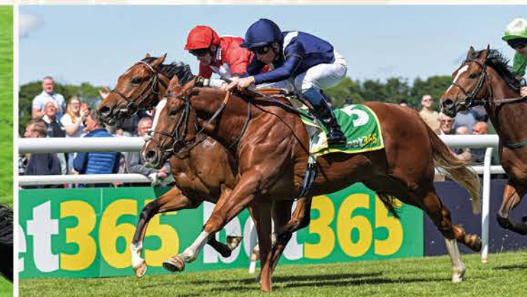
Chateau – Winner of the Rose Bowl Stakes Listed, in 2022