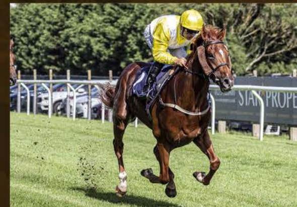
Inspired – 4¼ length maiden winner