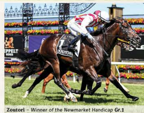
Zoutori – Winner of the Newmarket Handicap Gr.1