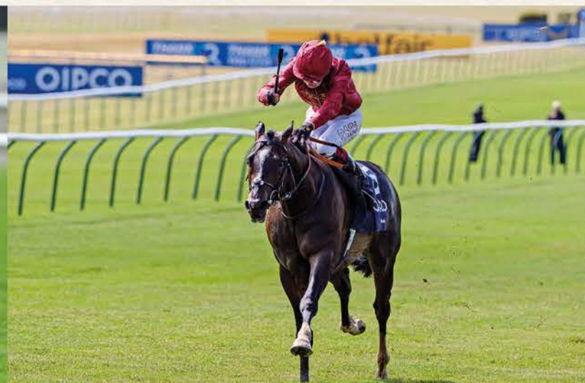
Kameko – The fastest winner of the 2000 Guineas in history