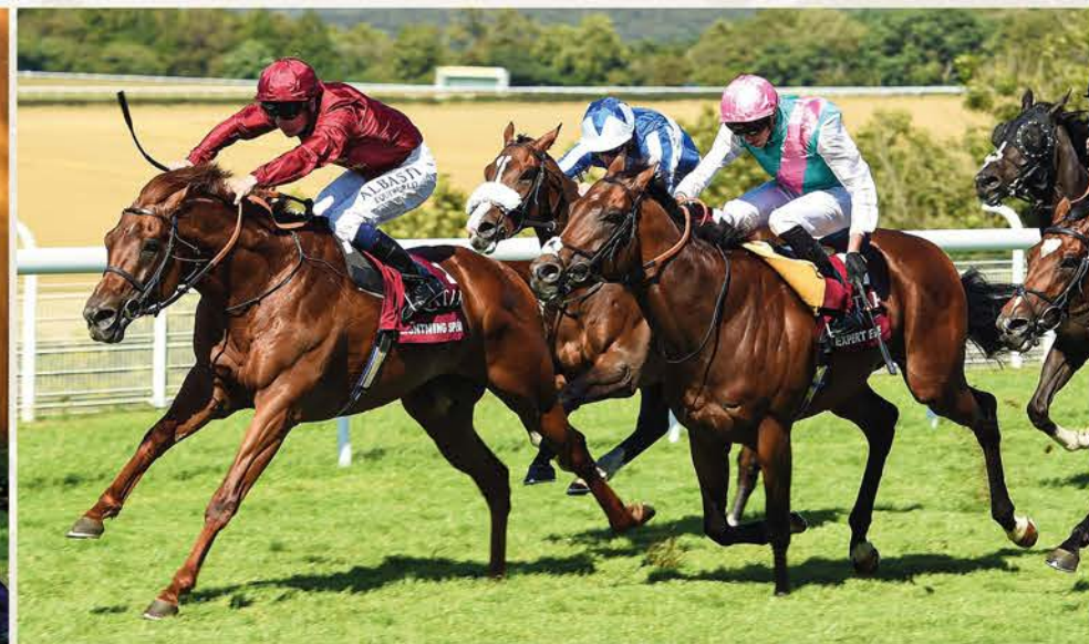
Lightning Spear – Winner of the Sussex Stakes Gr.1 defeating 3 Gr.1 winners and 3 Group winners