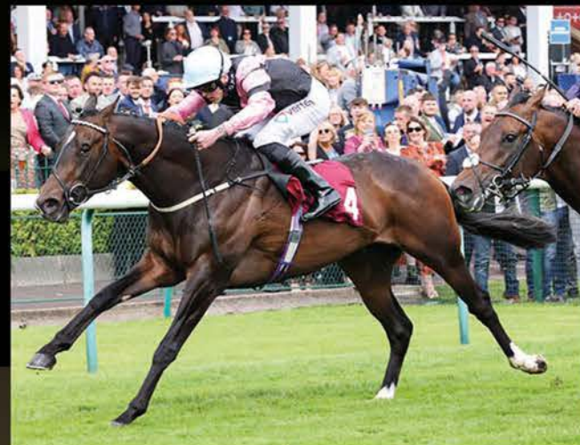
El Caballo (Havana Gold) winner of the Sandy Lane Stakes Gr.2 and Spring Cup Listed, in 2022.