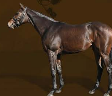
Filly ex Stellar Glow Sold for 280,000gns to Daithi Harvey / Highland Yard