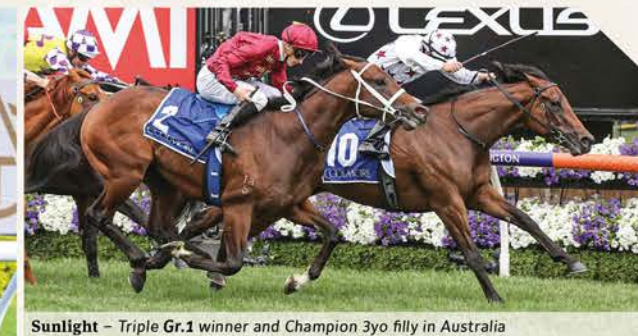
Sunlight – Triple Gr.1 winner and Champion 3yo filly in Australia