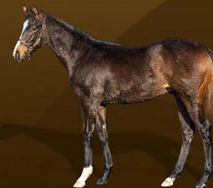
Colt out of Terrify