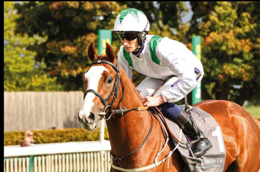
Dubai Mile (Roaring Lion) winner of the Criterium de Saint-Cloud Gr.1, in 2022.