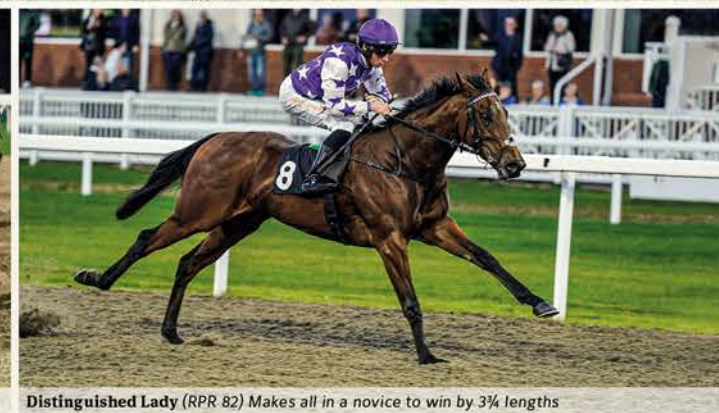
Distinguished Lady (RPR 82) Makes all in a novice to win by 3¼ lengths