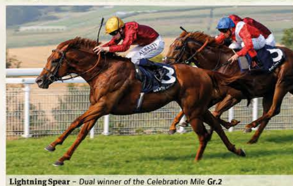
Lightning Spear – Dual winner of the Celebration Mile Gr.2