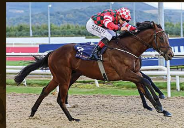
Brighter London – Impressive winner in Ireland

63% winners to runners from his first 2yos