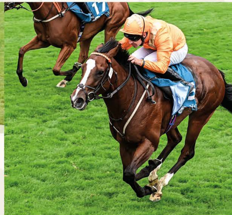
Streets of Gold – Unbeaten in 5 starts at 2, now aimed at the 2000 Guineas Gr.1