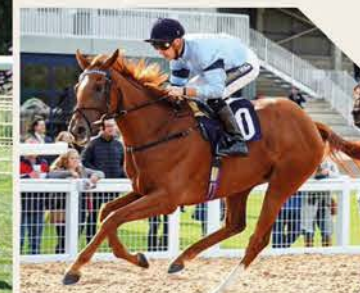
Pastiche (RPR 82) Dominant maiden winner