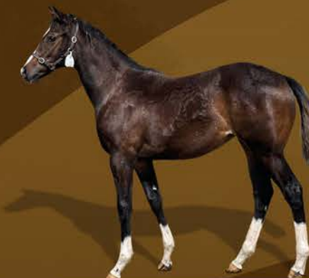
Filly out of Ripples Maid