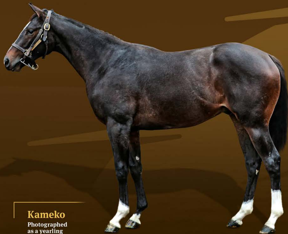
Kameko Photographed as a yearling

Breeders who have booked mares to Kameko include: