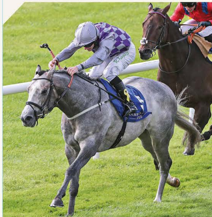
Havana Grey – Winner of Flying Five Stakes Gr.1, and Champion GB First Season Sire

The proven source of 2yo speed with 27 Stakes horses