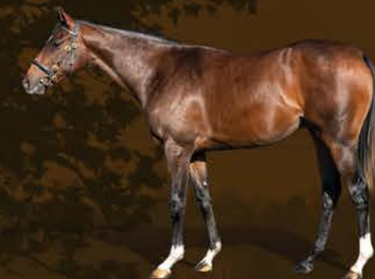
Filly ex Babylonian Sold for €300,000 to Newtown Anner Stud