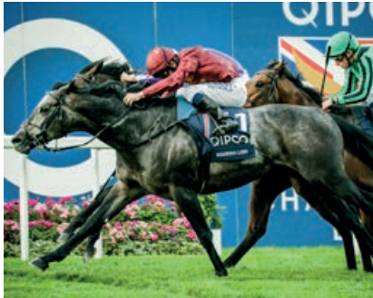
The Lion roars again in the QEII at Ascot

Superstar 3-year-old Roaring Lion won his fourth Gr. 1 in a row in the QEII Stakes and we are delighted to say he will join the Tweenhills stallion roster for 2019.